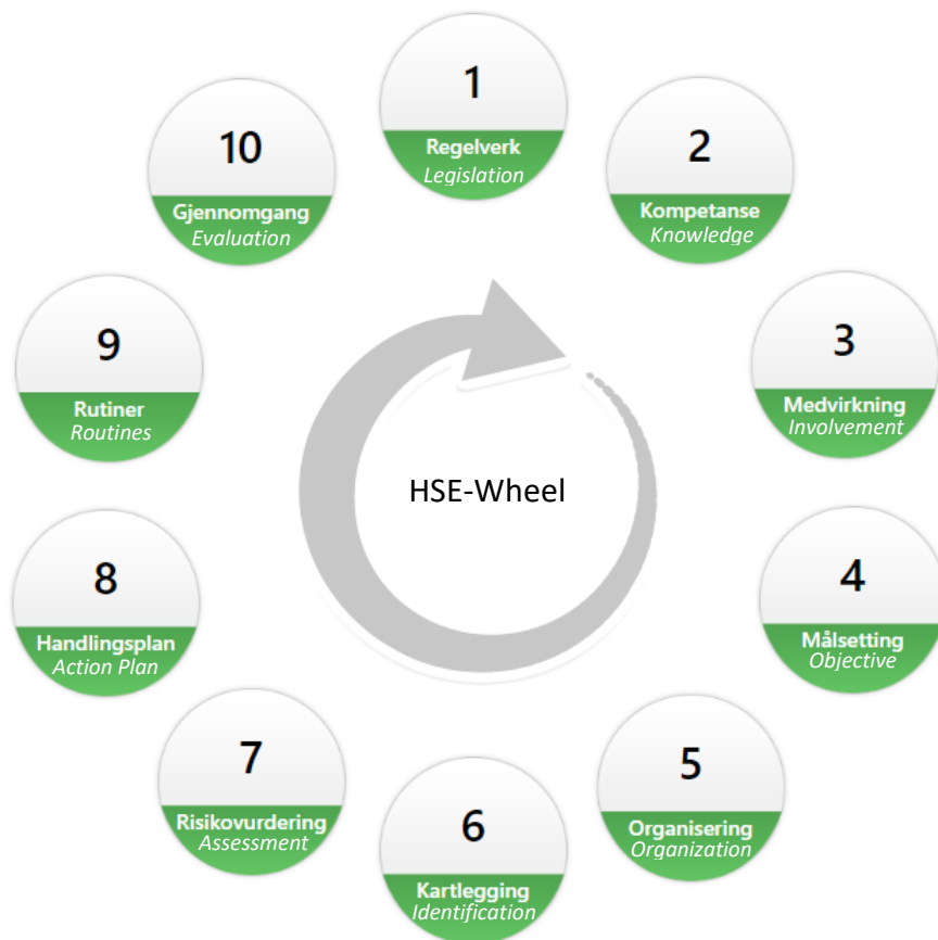
Sticos HSE and internal control dashboard